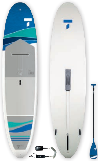
11'6 E-BREEZE PERFORMER